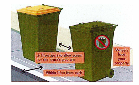
2-3 feet apart